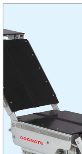
Radiolucent table top