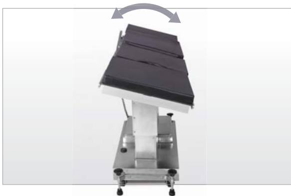
Lateral Tilt Position