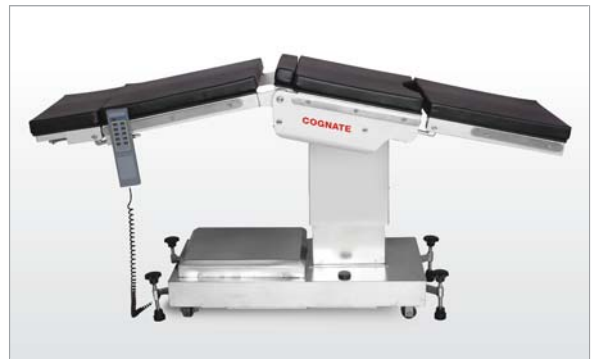
Jack Knife Position