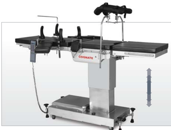
Height Adjustment – Up & Down