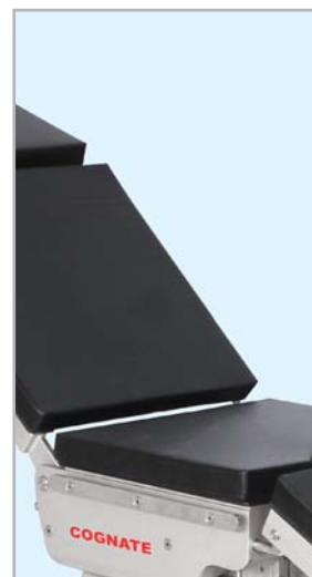
Long lasting PU Pads