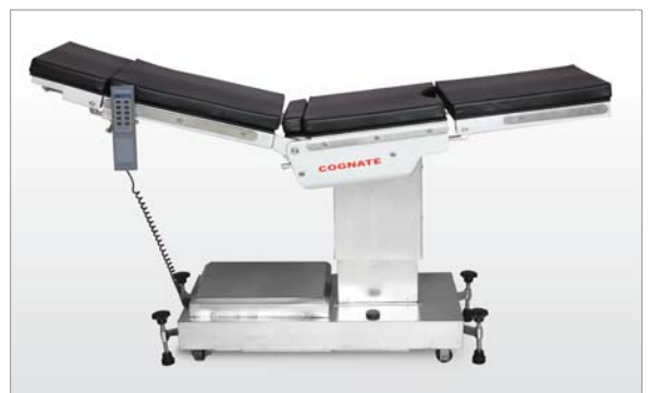
Reverse Jack Knife Position