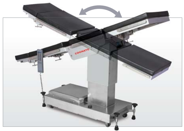
Trendelenburg / Reverse Trendelenburg